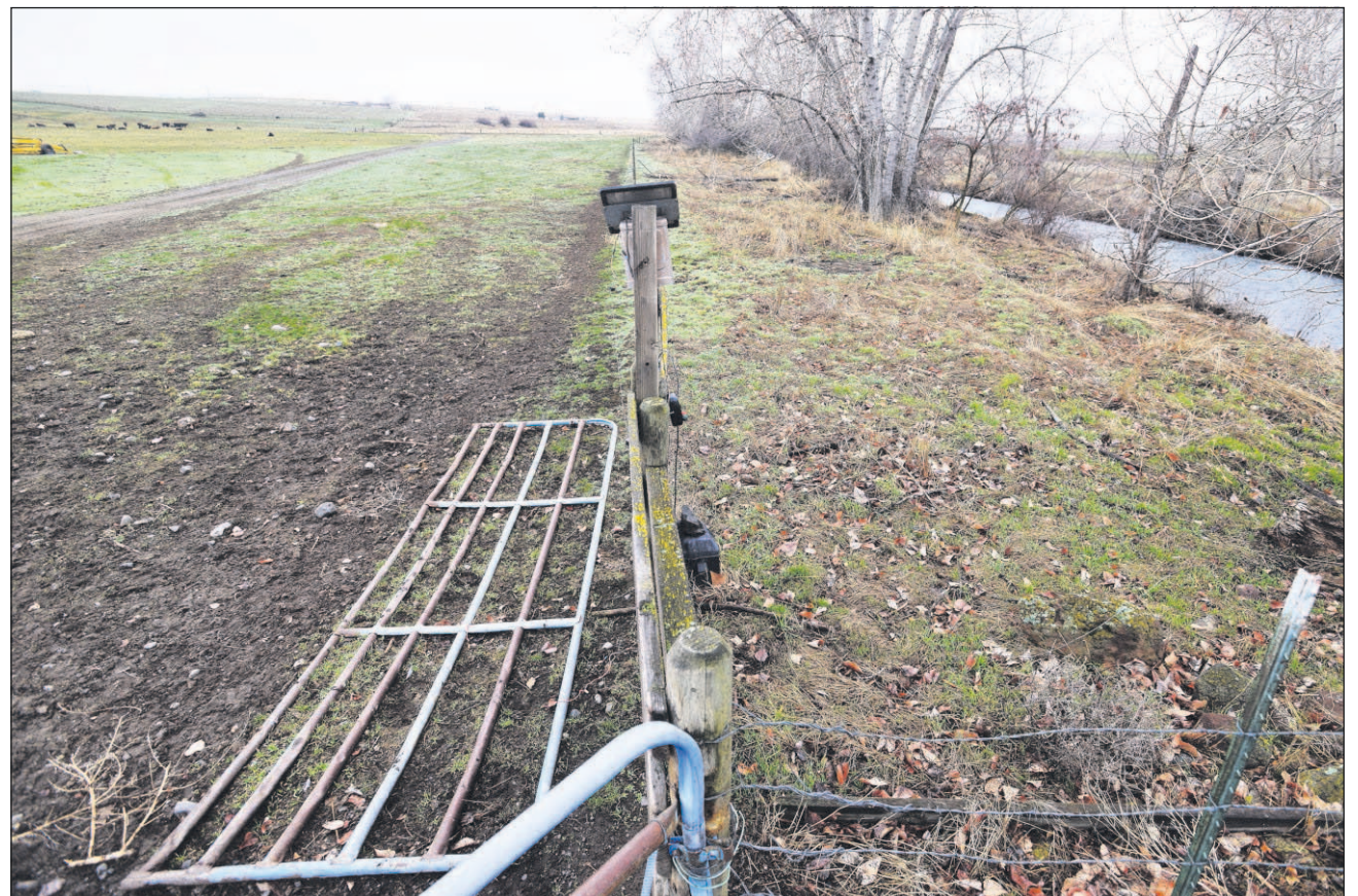
A fence line separates a cattle pasture from the banks of Birch Creek on the property of Colin Hemphill north of Pilot Rock. The fence was installed in 1989 as part of a ODFW stream bank stabilization program.

— Colin Hemphill, fifth-generation farmer and cattle rancher