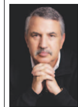
THOMAS FRIEDMAN Comment

Thomas L. Friedman won the 2002 Pulitzer Prize for commentary, his third Pulitzer for The New York Times . He became the paper's foreign-affairs Op-Ed columnist in 1995.