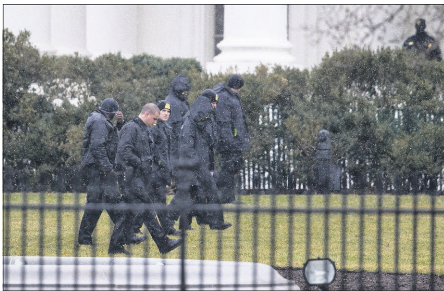
Members of the Secret Service search the grounds of the North Lawn of the White House in Washington, Monday.

The Federal Aviation Administration, pressed by Congress, had wanted to release proposed rules for small drones by the end of 2014. To the dismay of the