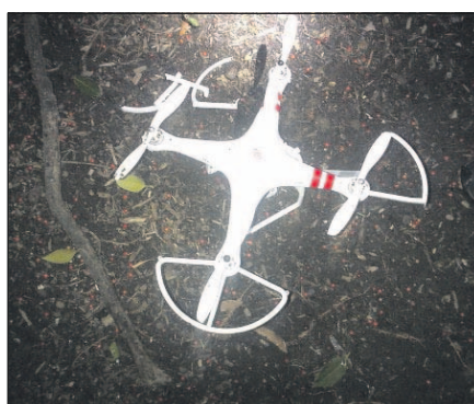
This handout photo provided by the U.S. Secret Service shows the drone that crashed Monday onto the White House grounds in Washington.

working on an executive order to address privacy issues raised by drones and had expected to release that order six months ago. But that has not happened.