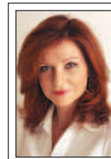
MAUREEN DOWD Comment

Top Johnson aide Jack Valenti told Michael Beschloss, the presidential historian, that LBJ aspired to pass a Voting Rights Act from his first night as president. Valenti said that his boss talked to him about it the night of JFK's assassination in the bedroom of Johnson's house in D.C., The Elms, before the newly sworn-in president went to sleep.