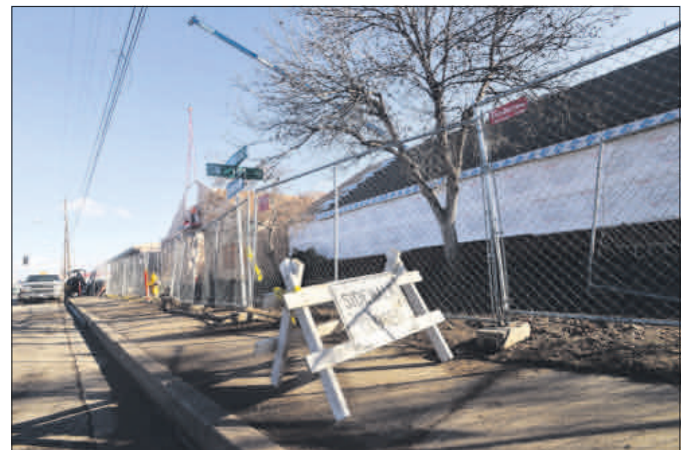
A boom crane is used to place the front façade of the new Pendleton Early Learning Center on Friday in Pendleton.