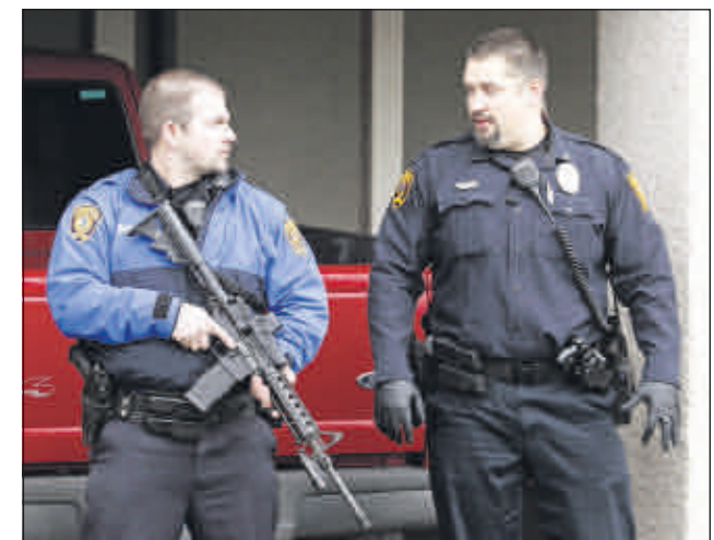
Police officers talk outside while emergency medical technicians aid one of the shooting victims in Moscow, Idaho, on Saturday.