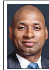
CHARLES BLOW Comment

It's hard to read stories like this and not believe that there is a double standard in the use of force by the police. Everyone needs