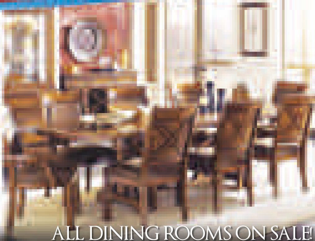
ALL DINING ROOMS ON SALE!