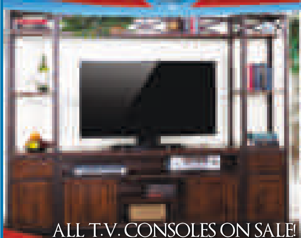
ALL T.V. CONSOLES ON SALE!