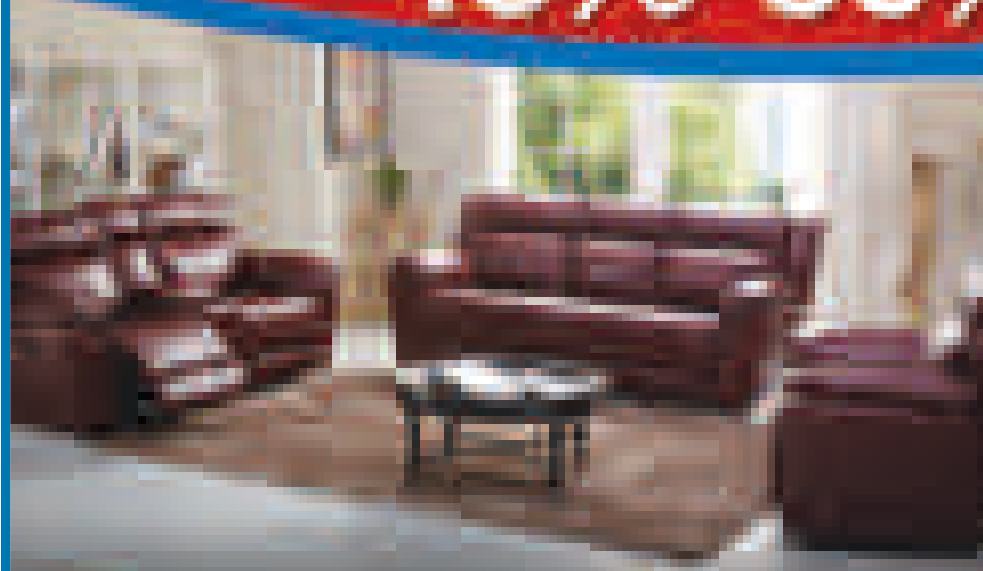
ALL LIVING ROOMS ON SALE!

*Some restrictions apply. See store for details. Excludes iComfort, Comfor-Pedic IQ, Tempur-Pedic, iSeries, Hot Buys & Clearance Items.