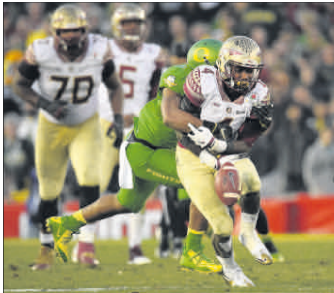
Oregon linebacker Justin Hollins, front left, forces a fumble by Florida State running back Dalvin Cook during the second half of the Rose Bowl NCAA college football playoff semifinal, Thursday, Jan. 1, 2015, in Pasadena, Calif.

Third-seeded Florida State's See ROSE/2B