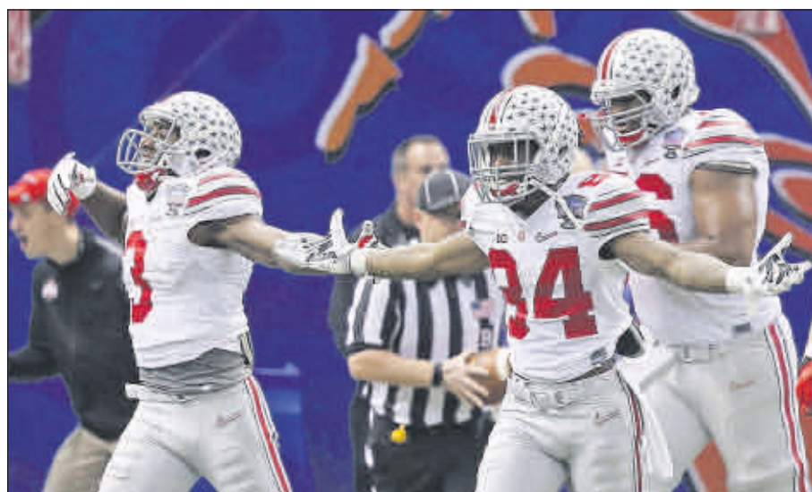
Ohio State players celebrates touchdown by running back Ezekiel Elliott in the second half of the Sugar Bowl NCAA college football playoff semifinal game against Alabama, Thursday, Jan. 1, 2015, in New Orleans.