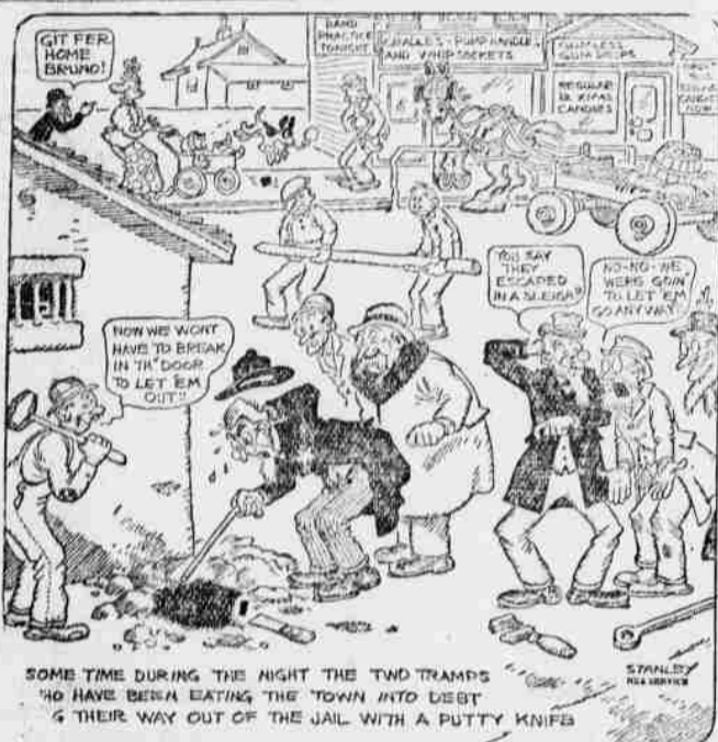
SOME TIME DURING THE NIGHT THE TWO TRAMPS WHO HAD BEEN EATING THE TOWN INTO DEBT GOT THEIR WAY OUT OF THE JAIL WITH A PUTTY KNIFE

Marked strength of most of the Erie issues was the feature of the railroad group, gains of 1 to 1 1/2 points being registered by the consolidations 4s and the A, B and D series of the convertible 4s.