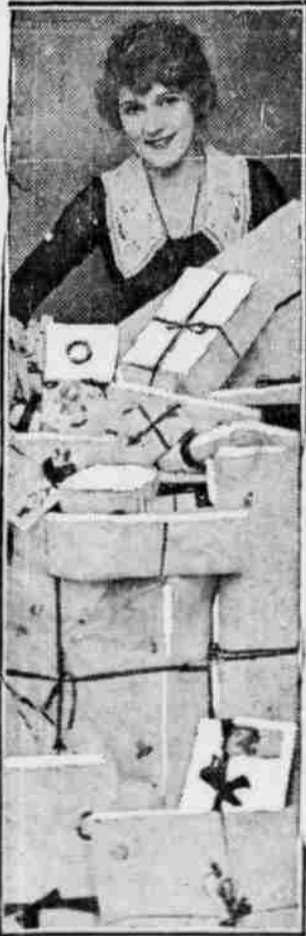
When Mary Pickford goes Christmas shopping she certainly puts a dent in the bankroll of her handsome husband. Here she is behind a pile of gifts which she is starting up their way in good season.