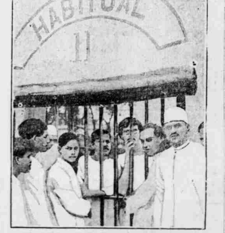
Although Mahatma Gandhi, Nationalist leader of India, is behind the bars, his son carries on for him. He is standing on the left before his father's cell receiving his advice.