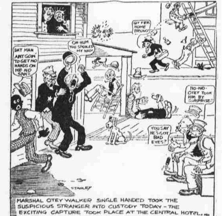
MARSHAL OTEY WALKER SINGLE HANDED TOOK THE SUSPICIOUS STRANGER INTO CUSTODY TODAY—THE EXCITING CAPTURE TOOK PLACE AT THE CENTRAL HOTEL.