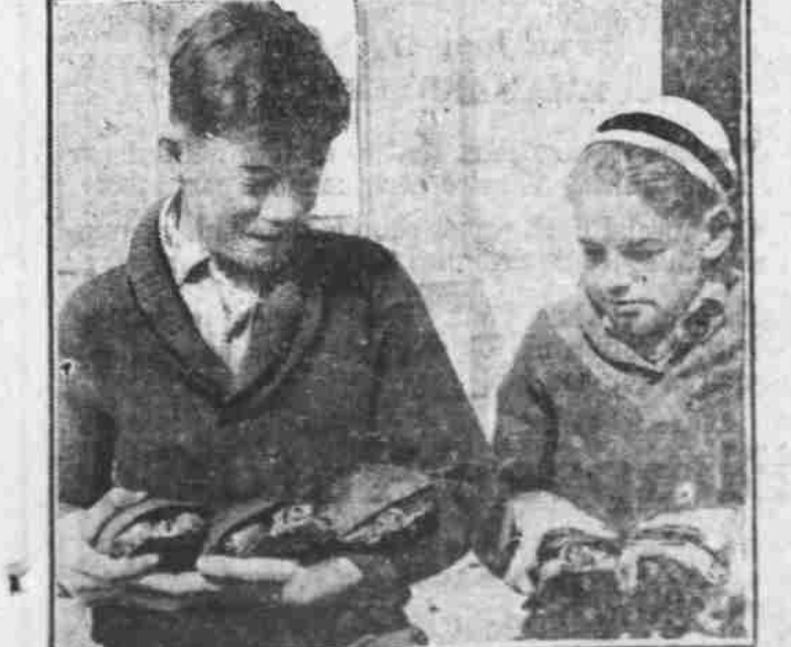
Five turtles are the sole survivors of a fire that cost $200,000. The dead are frogs, guinea pigs and white rats. When a fire destroyed a San Francisco frog farm the frogs jumped toward the flames. The turtles were not so curious.