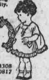
Dress 3308 Trans. 10817

A Butterick Pattern with Deltor tells you just how to do it—how to cut without wasting an inch—how to put it together in the twinkling of an eye—how to add just the little French touch which gives a child's frock that charming picture quality.