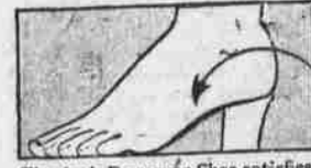
The Arch Preserver Shoe satisfies both Nature and Civilization.