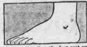
Nature plans that the foot rest on heel, ball and outside arch.

TRIMMINGS —Hand work of every kind. Peasant and Oriental embroideries in silk, yarn, chenille, metallic ribbon, crepe and tulle folds metal thread, ribbonize and bead work. Chenille motifs, the more colorful the better. Petal motifs, in ribbon, duvetine, velvet and metal cloth. Metallic touches in flowers, foliage, plumage, ribbon. Aluminum, steel, silver and gold bugles, sequins and clips. Agrafe, dagger and cabochon motifs of hammered metal, jewel-studded. Large flower and fruit motifs in brilliant coloring. Compact petal arrangements. Wings, bird-heads, pinwheels and quills, of fancy plumage, sometimes metalized. Torsades, cockades and fancy arrangements of ribbon, sometimes metal-edged. Weavings of two-tone ribbon or fabric folds. Medium long, full fluted ostrich plumes and bands. Pleatings, fringed bands (of floss, felt, duvetine, crepe, plumage) tassels and pompons. Applique ornaments. Hemstitching and picot finishes.