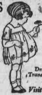
Dress 3183 Trans. 10948

Come in to-day and look over our stock of tempting odds and ends at still more tempting prices. The new Butterick Quarterly as our pattern counter will give you dozens of fascinating suggestions for using these lovely bits in your baby's Summer wardrobe.