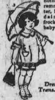
Dress 3581 Trans. 10734

Such fun to make! Just a snip or two of the shears—a few swift stitches—and that bewitching bit of brightly-colored gingham or fairy soft batiste, which you can pick up for almost nothing at our remnant counter, becomes a dainty new frock for your baby!