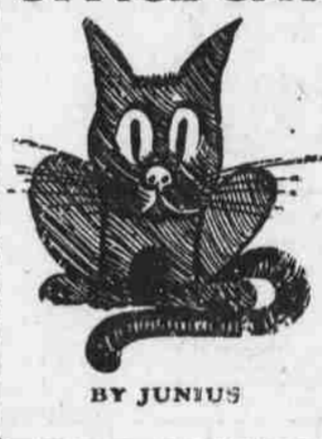
His Idea of Getting Even

As an index of character, the teacher was asking the class one after another what they would most like to do. "And what is your greatest ambition Jimmie?" she inquired. "I think it is to wash mother's ears."