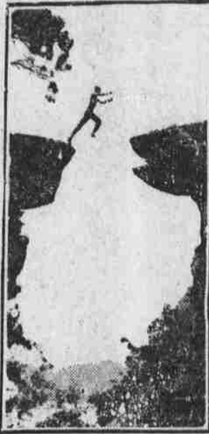
He leaped six feet from the cliffside to Standing Rock, The Dells, Wis., to get a close view of the rock. Now he's leaping back again.