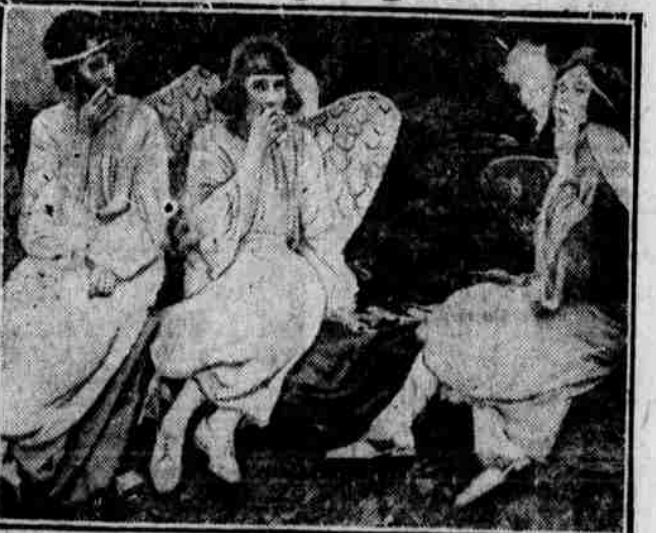
With their wings on, 'everything, angels in the "Cross Triumphant," society pageant at Washington, D. C., stop for a smoke behind the scenes.