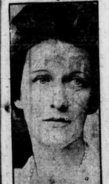
Latest photograph of Lady Astor. She will arrive in New York April 19, make a speech that day, go to Baltimore for another speech the next day and will speak in Washington and other cities.