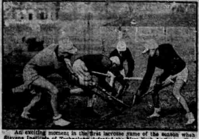
An exciting moment in the first lacrosse game of the season when Stevens Institute of Technology defeated the New York LaCrosse Club 7 to 6.