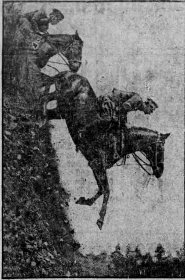
A daredevil equestrian of the Bulgarian army takes his steed down a 10-foot descent. He was in danger of breaking his neck, but this exhibition was for King Boris and the royal family.