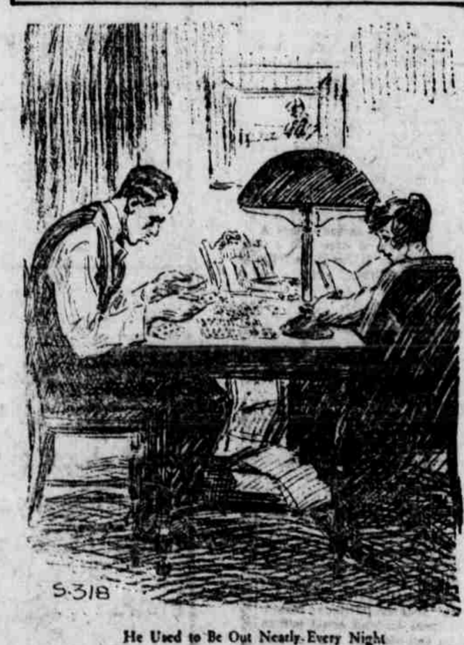
He Used to Be Out Nearly Every Night