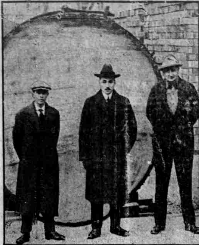
When this British Columbia fir log was cut up at Kobe, Japan, it yielded 41,000 feet of lumber. It was nine feet in diameter. Japan now looks to British Columbia for much of its lumber.

CUT THIS OUT! Bring it to the ARCADE THEATRE Tuesday Night, March 21st, Wednesday Night, March 22nd It will admit one adult or one child free to the Big Sereal STANLEY IN AFRICA. Not Good in the Afternoons.