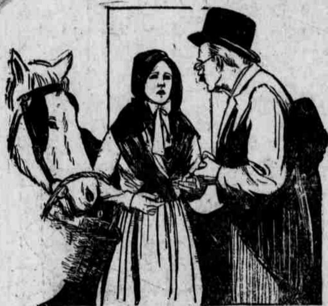
MARY MILES MINTER