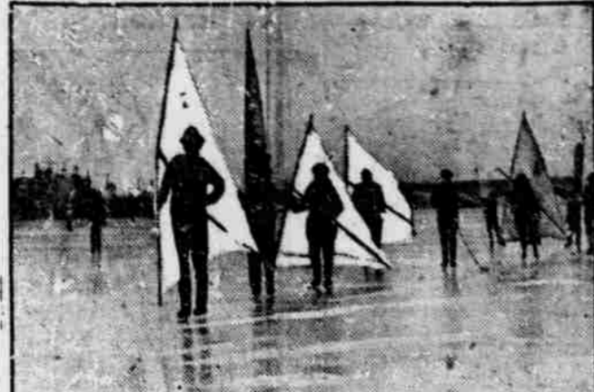
This is a familiar sight on New England rivers these days. A pair of skates, a bamboo pole and a sheet—and you are a human ice yacht. If the fellow in the lead takes a spill you're a human wreck.