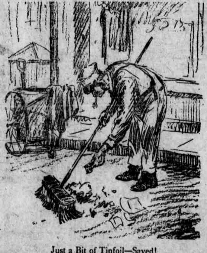
Just a Bit of Tinfoil—Saved!