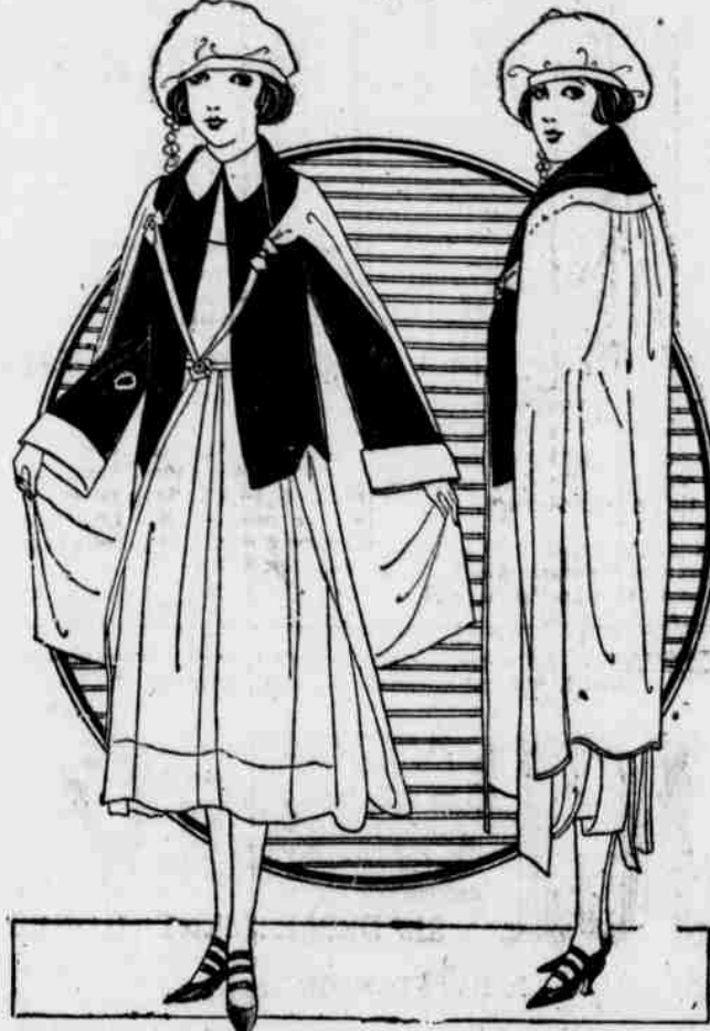
So popular are the smart, straight-lined jackets and lightweight capes that in this Claire model one finds an interesting combination of the two.