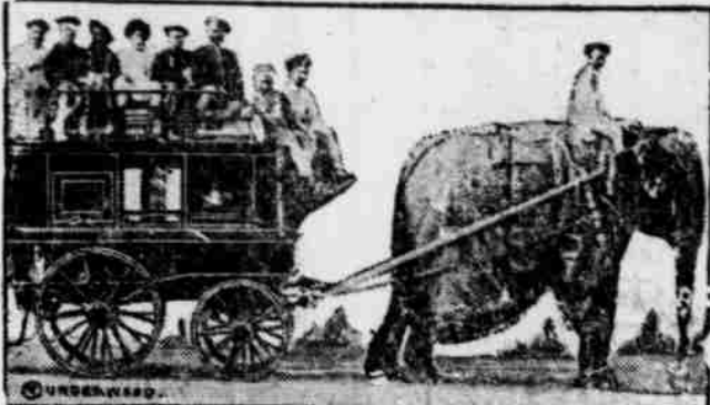
This bus is just like countless hundreds used in small towns of America, but it is a different machine power.