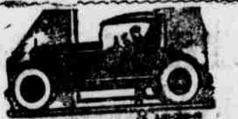
FOR SALE—2 tow truck, $300.00—See Penland Bros.