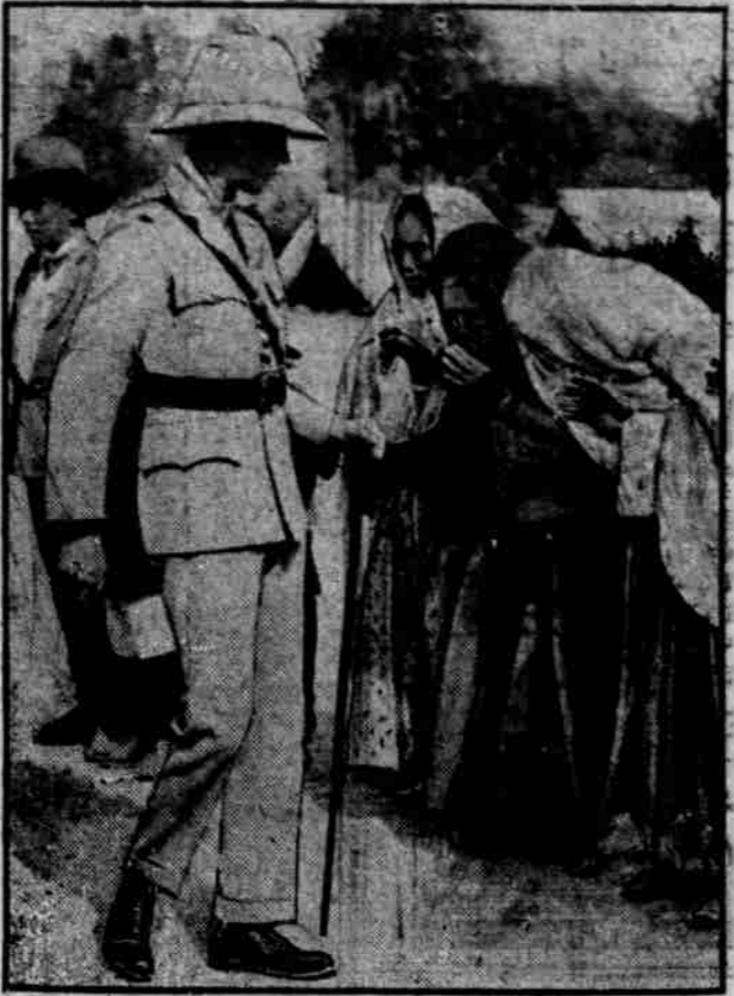
When the Prince of Wales arrived recently at Mandalay on his tour of India the widows of Burmese soldiers who died fighting for Great Britain turned out to honor him.