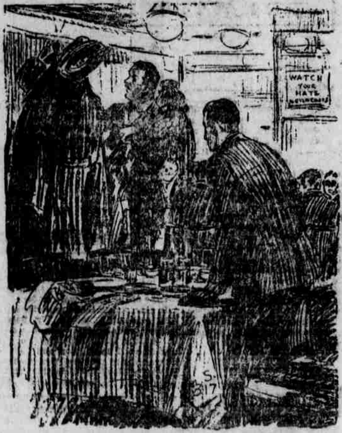
That New Bonnet You Just Paid 9 or 11 Dollars For 1