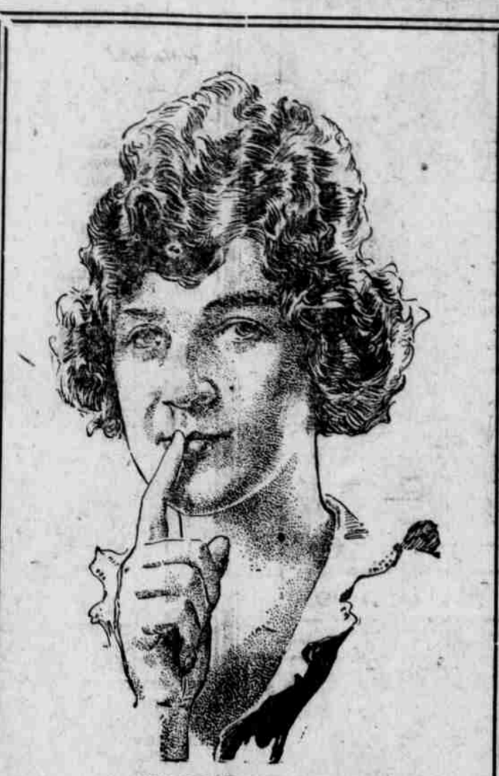
IT'S NO SECRET, BUT