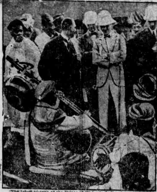
The latest picture of the Prince of Wales in India, shows him trying to act as though he likes native music furnished by the wealthy Gokhar of Baroda.