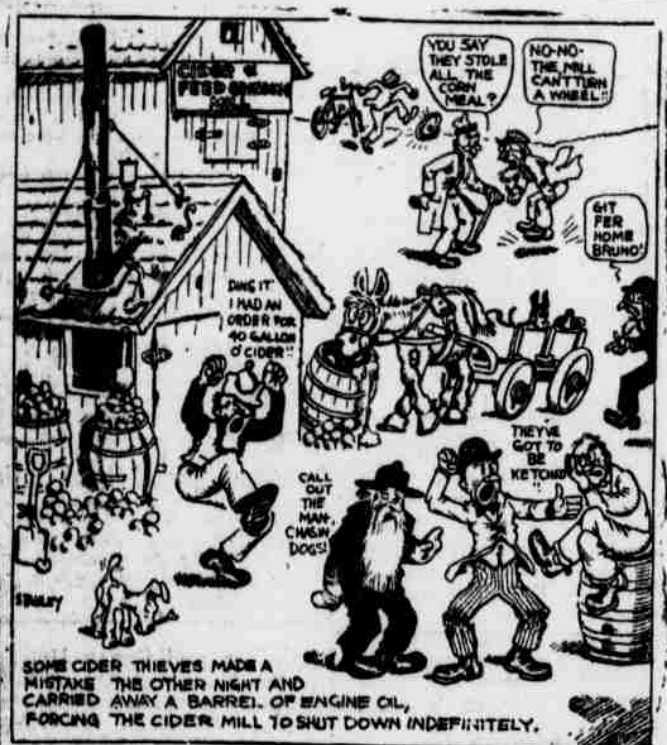
SOME CIDER THIEVES MADE A MISTAKE THE OTHER NIGHT AND CARRIED AWAY A BARREL OF ENGINE OIL, FORCING THE CIDER MILL TO SHUT DOWN INDEFINITELY.