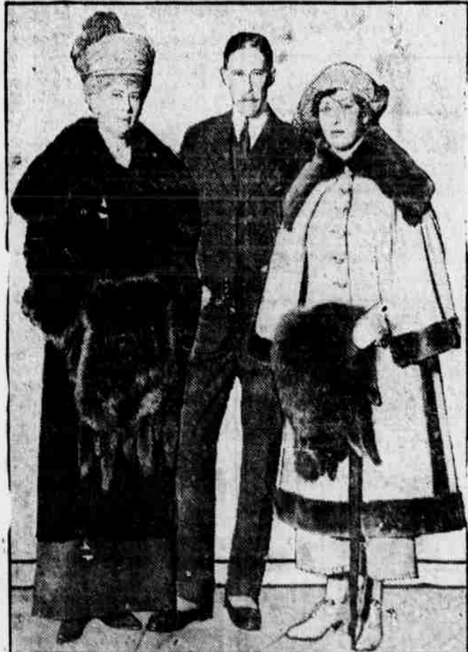
Queen Mary went along when Princess Mary and Count Lascelles left London to inspect Harewood House, where they will live, and to visit Lady Harewood who'll be Mary's mother-in-law.