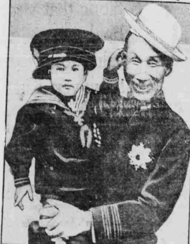
The little fellow twists the ear of the man upon whom the whole world turns its eyes—Kato, Japan's leading naval authority at the arms conference. But the boy has a perfect right to clown with the famous man, for he is his son.