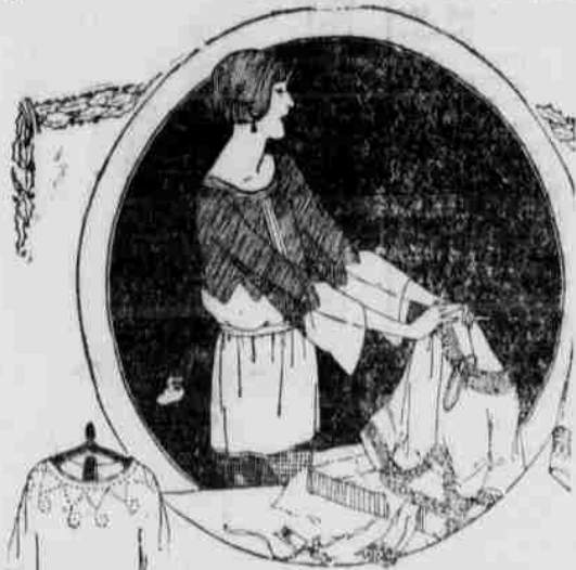
A wonderful gift for a woman. We box them for you.

BLOUSES of Georgette and soft, pretty silks in the latest styles of beaded and embroidered designs from..... $3.00, $5.00, $8.50 to $19.50