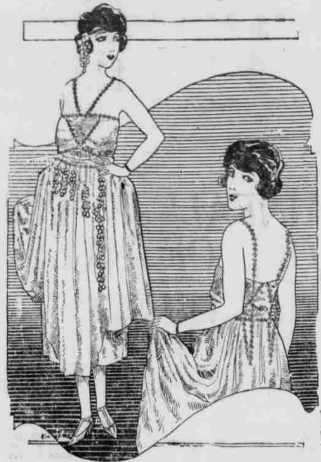
An exquisite frock for evening is this Claire design of tulle cloth and Royal Blue Salome velvet with silver grapes hanging from the waistline. The velvet bodice is held by Rhinestone chains which venture down the back and hang in looped, glittering lengths