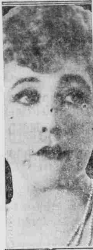
Ethel Clayton's next film, "For the Defense," will be up-to-date in one respect. The jury box in the trial scene will be furnished with a curtain to protect women jurors' ankles from the gaze of court spectators.