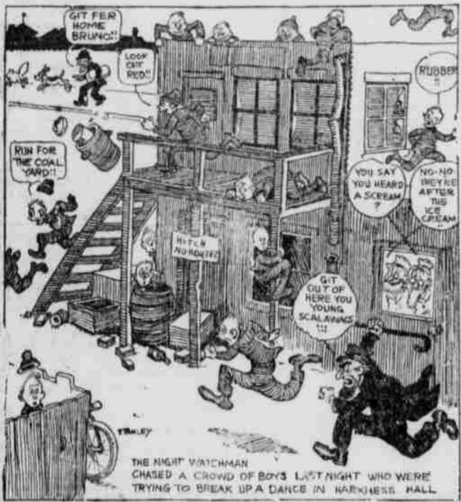
THE NIGHT WATCHMAN CHASED A CROWD OF BOYS LAST NIGHT WHO WERE TRYING TO BREAK UP A DANCE IN HARNISS HALL.