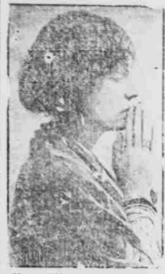
Nance O'Neil in "The Passion Flower" at the Rivoli Theatre, Nov. 21.

Potatoes and turnips are being fed to cattle, the farmers preferring to adopt this measure of disposal rather than pay the high duty and the cost of barrels.