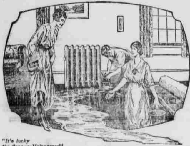
"It's lucky the floor is Valsparred"

A. FOLGER & CO. San Francisco Kansas City - Dallas Shanghai, Japan