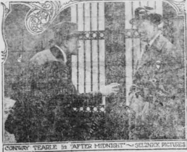
CONWAY TEARLE in "AFTER MIDNIGHT" - SELZNICK PICTURES

A giant in size, Swain stands six feet four inches and weighs close to 250 pounds. He is a native of Salt Lake