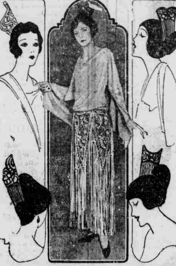
A Paul Poiret costume which suggests the Spanish is a combination of green crepe cashmere and black and white fringe. The waist part is draped in a novel manner, the one piece of cloth being so arranged as to form sleeves and a cape-like effect in the back. Richly embroidered points and heavy fringe cover the skirt.