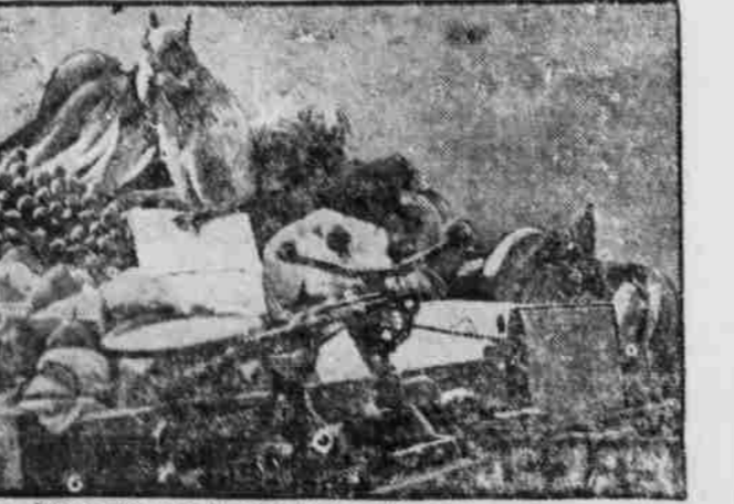
Congressmen pay for what they get from this push cart on Capitol Hill, Washington. But not the squirrels. When the vendor turns he back the squirrels' front.