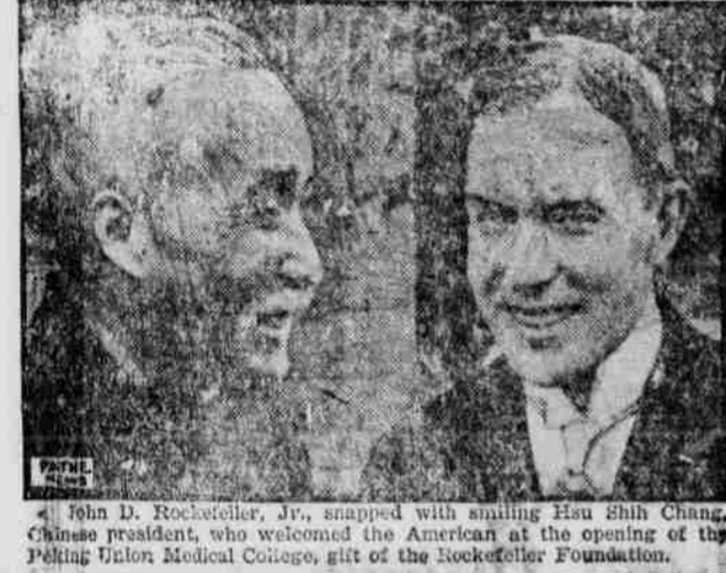
John D. Rockefeller, Jr., snapped with smiling Hsu Shih Chang, Chinese president, who welcomed the American at the opening of the Peiking Tector Medical College, gift of the Rockefeller Foundation.