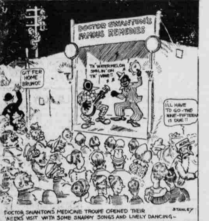
DOCTOR SWANTON'S MEDICINE TROUPE OPENED THEIR WEEKS VISIT WITH SOME SNAPPY SONGS AND LIVELY DANCING.