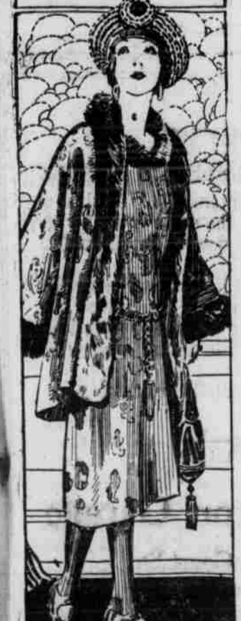
popular styles. This one is of crepe unatelasse handed with fox. The