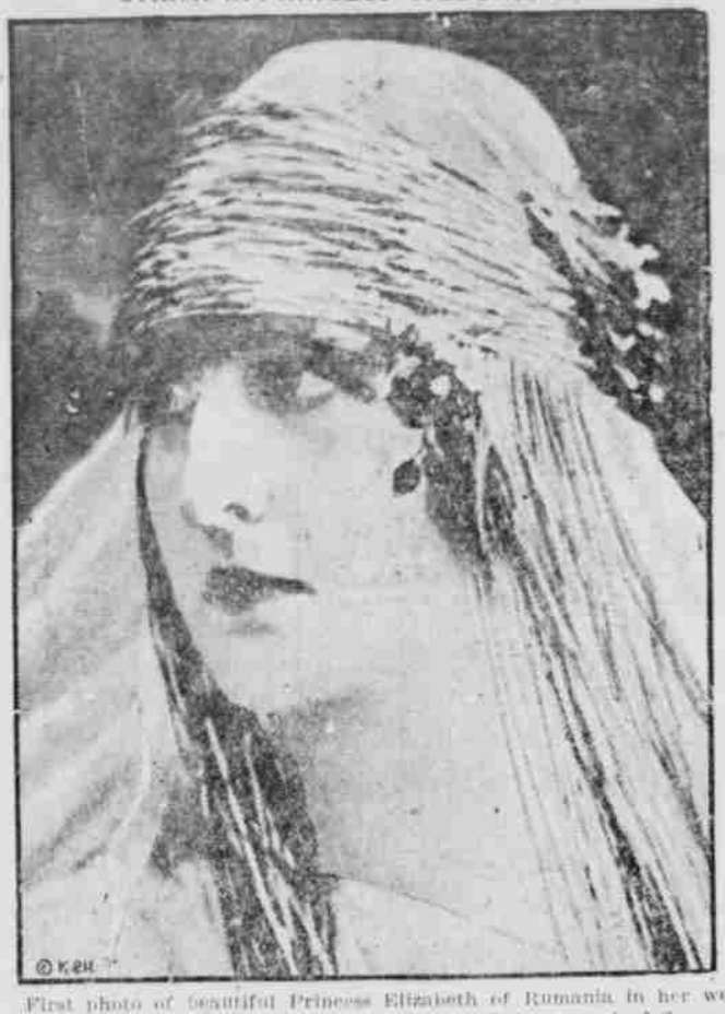
taken on the occasion of her wedding to Prince Carol of Greece. is the band of straw around the head, knotted at the back and draped over the shoulders