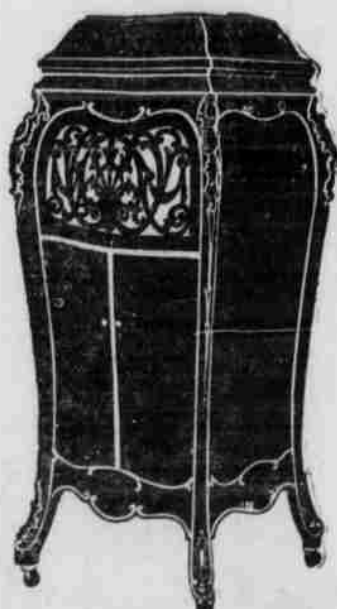
Price $25.00 to $1000