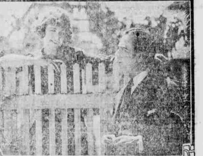
EDNA MURPHY AND JOHNNIE WALKER IN "LIVE WIRES"

Appearances Kitty Mitchell, private secretary of Sir William Hatherford, a wealthy Englishman, resents the jealousy of Lady Hatherford because of her husband's attentions to her. Kitty is unhappy that Sir William secretly loves her, and she deeply loves Herbert Gardner, a young architect, ambitious and unscrupulous. Herbert is being led beyond his means in an effort to buy up old estates and when he receives a job to build a big grand hotel and a chain of theatres, he proposes to Kitty and their marriage is consummated.