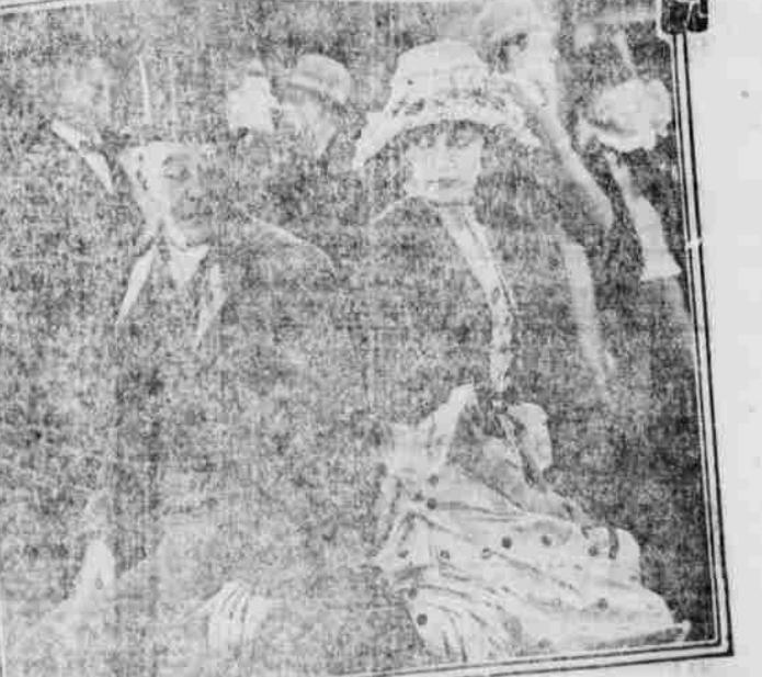
TOM MOORE AND NAOMI CHILDERS IN "MR. BARNES OF NEW YORK"