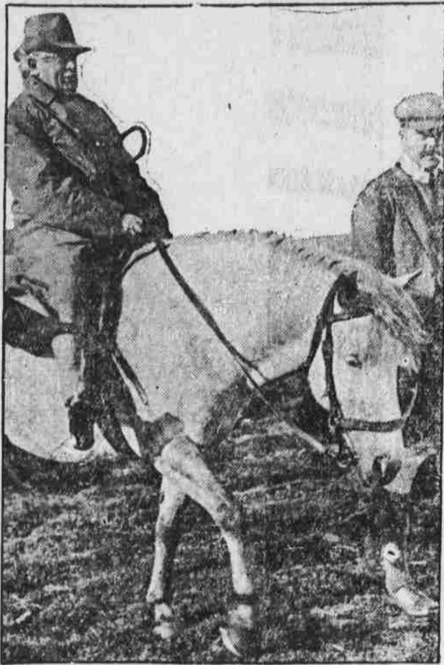
Lloyd George doesn't claim to be much of a horseman. He's too busy to become an expert rider. So he was perfectly willing to let the Duke of Atholl lead the horse when he went for a ride on his vacation in the Mountains of Atholl, Scotland.