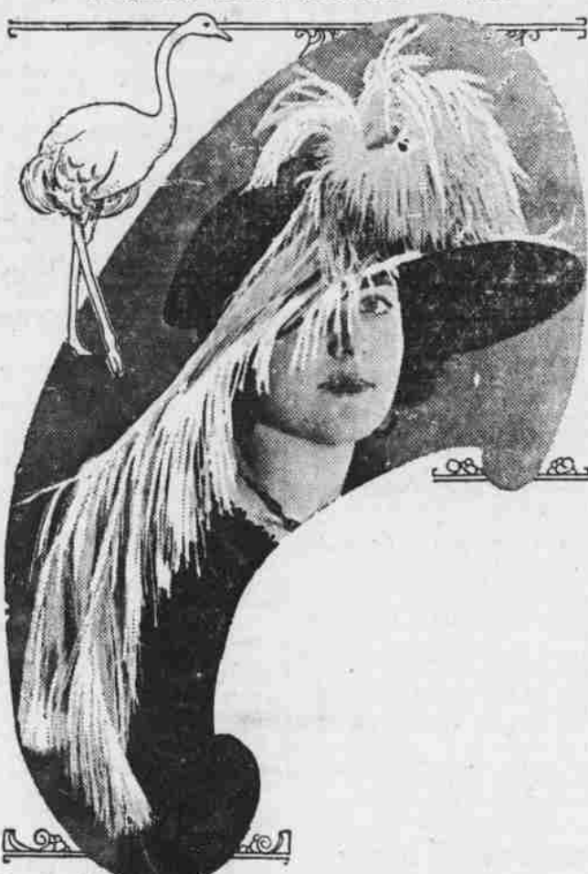
From Paris come a lot of hats showing the most astounding use of plumes. This hat of black velvet has an uncurled ostrich plume which conceals like a Turkish lady's veil. Another hat shows a huge plume attached to the back whose strands fall like a cape to the waist line.