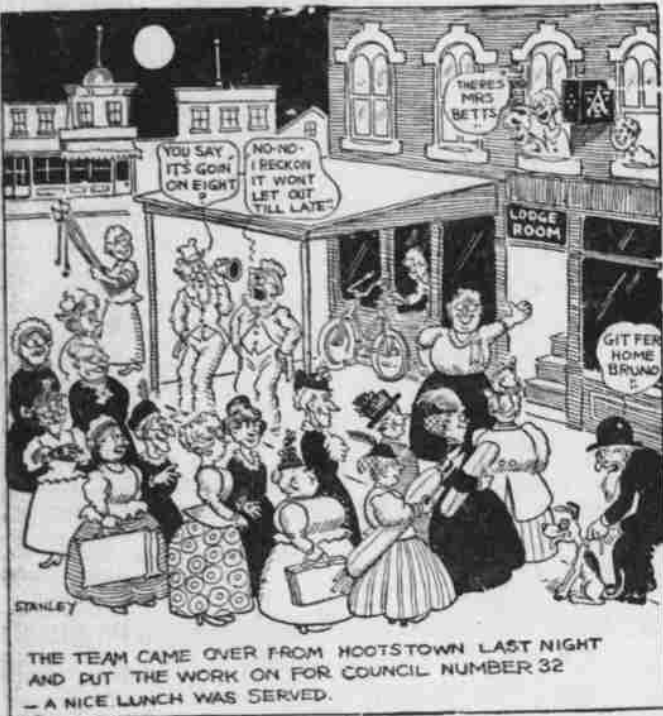
THE TEAM CAME OVER FROM HOOSTOWN LAST NIGHT AND PUT THE WORK ON FOR COUNCIL NUMBER 32 - A NICE LUNCH WAS SERVED.