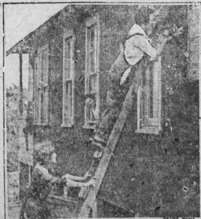
The rent problem has caused many a gray hair in New York City, but this family found a way to defeat the profiteering landlord. While the men work the women ply hammers and saws to the work of building their new home at 400 West 11th St. N. Y.

Use the Phones Grocery, 2 Phones 526 Other Depts. 73